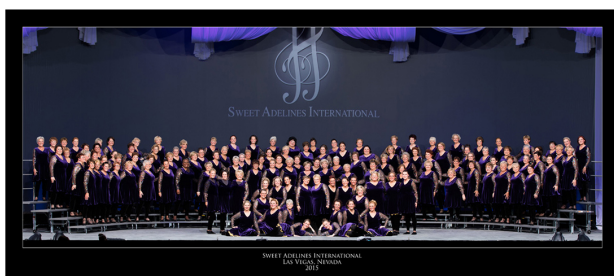
8 X 18

When ordering onstage chorus photos we suggest choosing a more rectangular print size to accommodate the width of the stage. See Examples Below.